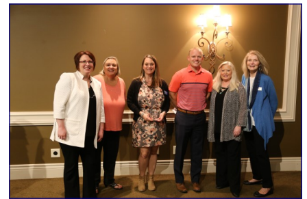
Outstanding Program Support Partner of the Year Grand Island Community Foundation