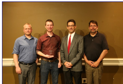
New Business Partner of the Year Prairie Pride Brewing, Co.