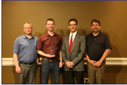
New Business Partner of the Year