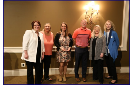
Outstanding Program Support Partner of the Year