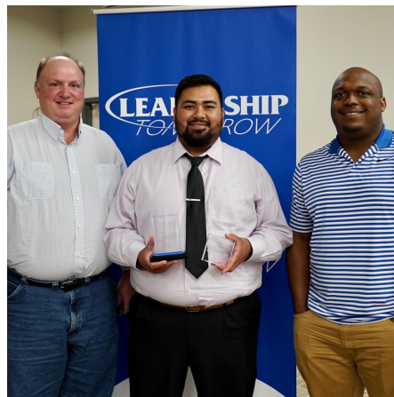
Outstanding Program Support Partner of the Year