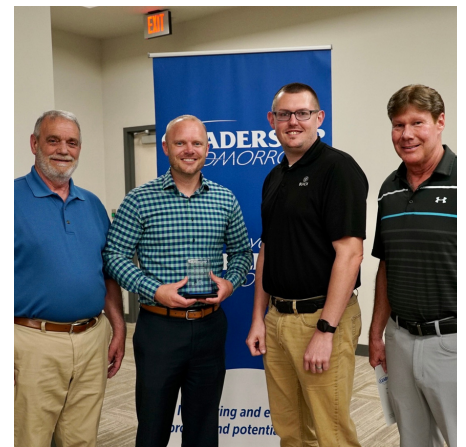
New Business Partner of the Year