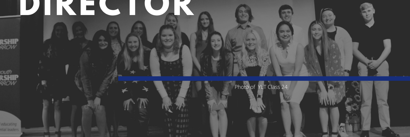
Photo of YLT Class 24